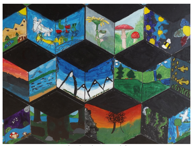
(a little peak)